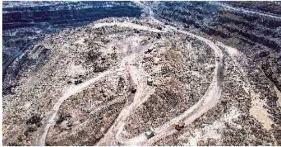
LEVY CONFLICT. The Centre had opposed the retrospective levy of tax (since 1989) on mines and mineral-bearing land by the States

Earlier, on July 25, a 9-judge Constitution Bench of the Supreme Court held by an 8:1 majority that the States have the power to levy tax on mineral rights. It held that legislation like Mines and Minerals (Development and Regulation) Act, 1957, do limit such power. States (like Odisha, Chhattisgarh and Jharkhand - whose per